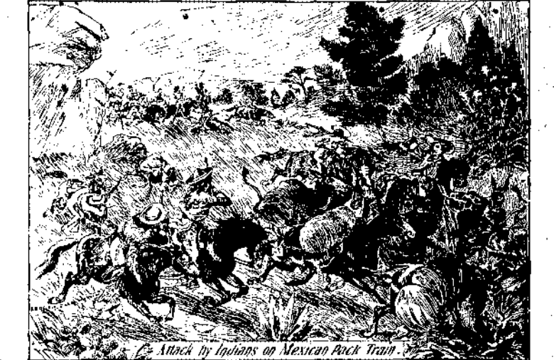
An Attack by Indians on Mexican Rock Train

EXCITING AND THRILLING REPRODUCTIONS OF MODERN AND ROMANTIC HISTORY. Portrayed by Indians and Natives of Many Nations.