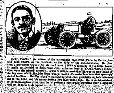
Winner of the automobile race between Paris and Berlin.