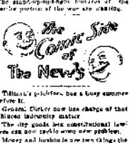
Illustration of a person reading a newspaper.

President and Fairbanks Run Are Expected to Be Nominations. President and Fairbanks are expected to be nominated.