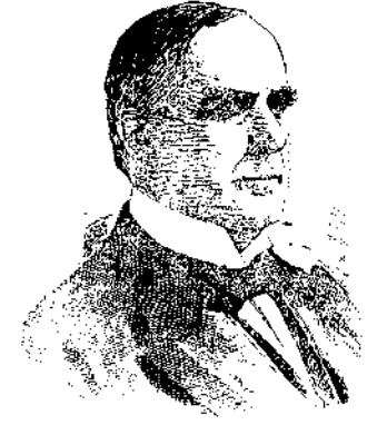
WILLIAM MCKINLEY, Elected President