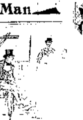
Who has his clothes made here?