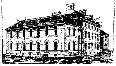
DISPENSARY HOSPITAL, SHELTER ISLAND.

... (continuation of text describing anecdotes)