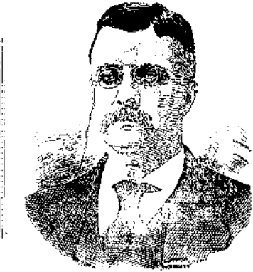
THEODORE ROOSEVELT, Vice-President Elect