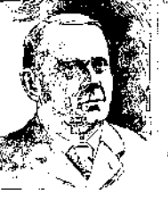
Portrait of a man, likely a political figure mentioned in the text.