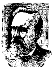
Portrait of a man, likely a political figure mentioned in the text.

The House will be controlled by the Republicans, while the Senate will be controlled by the Democrats. This is the result of the recent elections.