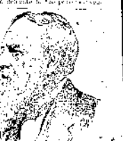
Portrait of a man, likely Senator Hazel mentioned in the text.

Additional text related to the portrait or the article.