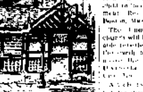
Name of the building in the illustration above.

Continuation of the text about crops, detailing the impact of weather on various farming regions.