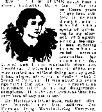
Portrait of a woman, likely related to the Pe-ru-na advertisement.

Catarrh and Nerve-cure... A detailed medical explanation of the connection between catarrh and nerve damage. It discusses the symptoms, the underlying causes, and the effectiveness of Pe-ru-na as a treatment.