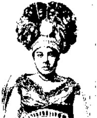
Portrait of a woman, likely related to the 'CUPIN AGAINST HER WILL' article.