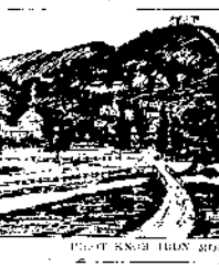
Illustration of a mountain, likely related to the 'IRON MOUNTAIN'S MINGEMER' article.