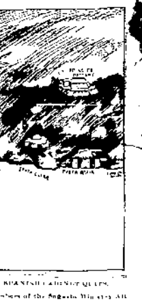
DEFENSES OF HAVANA IN DETAIL.

General Wainwright. General Wainwright is a very famous general. He is very famous, and he is very famous. He is very famous, and he is very famous.