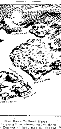
DEFENSES OF HAVANA IN DETAIL.

General Wainwright. General Wainwright is a very famous general. He is very famous, and he is very famous. He is very famous, and he is very famous.