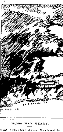
DEFENSES OF HAVANA IN DETAIL.

General Wainwright. General Wainwright is a very famous general. He is very famous, and he is very famous. He is very famous, and he is very famous.