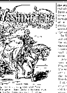
THE MAN IN THE SUIT