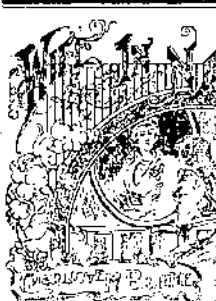
THE MAN IN THE SUIT