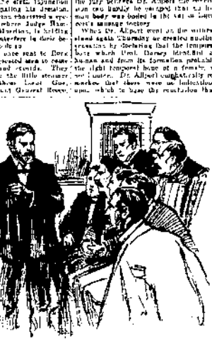
"THIS MAN IS FROM A HOG"