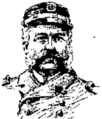
REAR ADMIRAL BEARDSLEE.

The Senate and House have spent the week discussing the President's message to Congress. The message outlined the administration's policies and goals for the year. The Senate and House have held several sessions to debate the message and to pass legislation. The President's message was a comprehensive report on the state of the country and the administration's plans for the future.