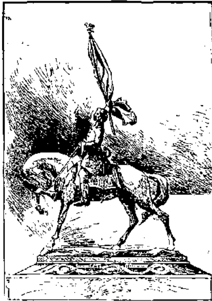
THE LOGAN MONUMENT AT CHICAGO.

Chicago, Ill., April 25.—The unveiling of the magnificent Logan statue in Chicago today was the grandest demonstration in the city's history. The statue, which stands on a high pedestal in the center of the city, is a masterpiece of art and a fitting tribute to the great soldier and statesman. The ceremony was attended by thousands of people, including many of the veterans who fought in the Civil War. The statue is a masterpiece of art and a fitting tribute to the great soldier and statesman. The ceremony was attended by thousands of people, including many of the veterans who fought in the Civil War.