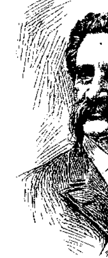
JOHN A. LOGAN.

The unveiling ceremony was held in the presence of a vast throng of people, and the statue was unveiled with great pomp and circumstance. The statue is a masterpiece of art and a fitting tribute to the greatest of American statesmen.