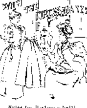
Notes for the Editor.

...the fact that it is not unusual for them to be found in the streets of our cities, and in some cases, they are found in the streets of our cities.