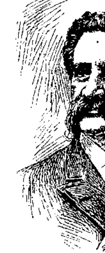
JOHN McLAUGHLIN LOGAN

The unveiling of the Logan statue in Chicago today was the grandest demonstration in the city's history. The statue, which stands on a high pedestal in the center of the city, is a masterpiece of art and a fitting tribute to the great soldier and statesman. The ceremony was attended by thousands of people, including many of the veterans who fought in the Civil War.