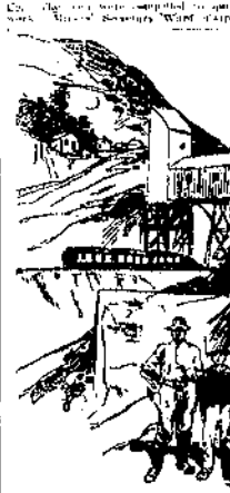
A COAL MINE AND MINERS HOME IN THE PANHANDLE DISTRICT.

Pittsburgh, Pa., March 10.—The coal miners' strike in this district shows no signs of settling. The miners' union has refused to accept the offer made by the coal operators, and the strike continues. The situation is far from settled, and the miners are determined to continue their fight for better conditions.