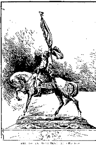
THE LOGAN STATUE AT CHICAGO.

Chicago, Ill., March 10.—The unveiling of the magnificent statue of Abraham Lincoln, the first of its kind in the world, was the grandest event of the city since the war. The statue, which is the work of the sculptor Augustus St. Gaudens, is a masterpiece of art and a fitting tribute to the greatest of American statesmen. The unveiling ceremony was held in the presence of a vast throng of people, and the statue was unveiled with great pomp and circumstance.