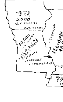
ENORMOUS EXTENT OF THE SUIT-COAL STRIKE AND NUMBER OF MEN NOW ON STRIKE.

The strike in the coal fields of the United States has begun in earnest. The miners, who are well organized and very much in earnest, have thrown down their picks and are fighting a bitter fight for a fair deal. The strike is directly endangering the lives of the operators and threatening to shut operations in a large area of the United States. The court-miners may stop the strike until they see a fair deal in Indiana. The miners are a well-organized and earnest force, and they will continue to fight until they see a fair deal.