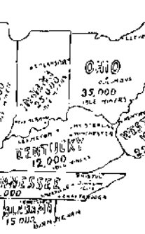
ENORMOUS EXTENT OF THE SUIT-COAL STRIKE AND NUMBER OF MEN NOW ON STRIKE.

The strike in the coal fields of the United States has begun in earnest. The miners, who are well organized and very much in earnest, have thrown down their picks and are fighting a bitter fight for a fair deal. The strike is directly endangering the lives of the operators and threatening to shut operations in a large area of the United States. The court-miners may stop the strike until they see a fair deal in Indiana. The miners are a well-organized and earnest force, and they will continue to fight until they see a fair deal.