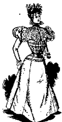
BUTTERICK PATTERN 5003.

THE KING'S NEW DISCOVERY is a most valuable medicine for the cure of all kinds of coughs and colds. It is a most valuable medicine for the cure of all kinds of coughs and colds. It is a most valuable medicine for the cure of all kinds of coughs and colds.