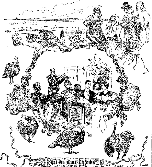
Let Us Give Thanks