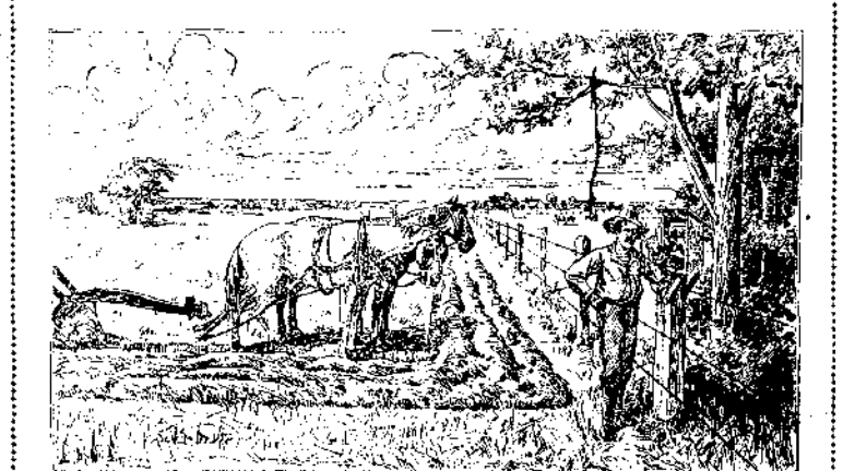
WOMAN WALKING DELEGATE.

In conclusion, the telephone is a most valuable asset for the farmer. It is a device that has made a great difference in the way the farmer lives and works. It is a device that every farmer should have.