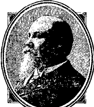
HAZEN S. PINGREE