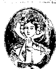
Queen Victoria, the longest-reigning monarch in British history.

The death of Queen Victoria, the longest-reigning monarch in British history, has plunged the British Empire into a period of mourning. The Queen, who reigned for 62 years, 7 months and 10 days, passed peacefully away at 82 years of age.