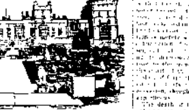
The Royal Palace in London, the residence of the British monarch.

The Queen's death has been met with a sense of profound grief throughout the British Empire. Her reign was a period of unparalleled stability and growth for the United Kingdom.