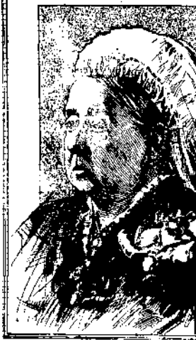
Alexandrina Victoria, the Queen of the Hellenes.

The Queen of the Hellenes, Alexandrina Victoria, has passed peacefully away. She was the daughter of Queen Victoria and Prince Albert.