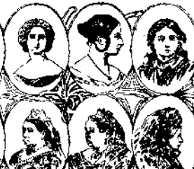
The Royal Family of Greece, including the new King and Queen.

The new King and Queen of Greece have been crowned. The ceremony was a grand affair, attended by many guests.