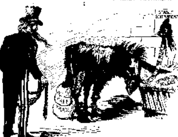
Illustration of a man in a suit, possibly a politician or lawyer, standing and speaking.

The bill was passed by a vote of 215 to 197. The bill was passed by a vote of 215 to 197. The bill was passed by a vote of 215 to 197.