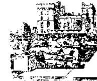
The Royal Palace in London, the residence of the British monarch.

The Queen's death has been met with a sense of profound grief throughout the British Empire. Her reign was a period of unparalleled stability and growth for the United Kingdom.