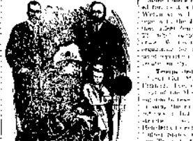
King Edward VII, the eldest son of Queen Victoria.

Queen Victoria's eldest son, Edward, has been crowned King of Great Britain. The ceremony was a grand affair.