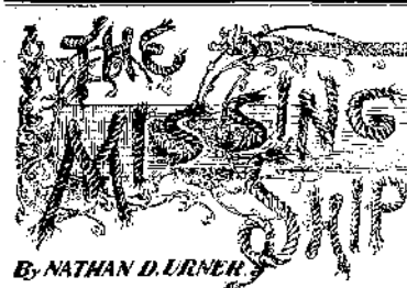
By NATHAN D. URNER

PHILADELPHIA, Aug. 10.—(Special to the Associated Press.)—The city of Philadelphia is today celebrating the centennial of the signing of the Declaration of Independence.