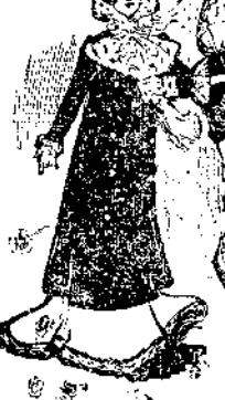
Illustration of a man, possibly the 'Eye King' mentioned in the text.

A man known as the "Eye King" has been arrested for a series of crimes. He is a notorious figure in the underworld and has been involved in numerous illegal activities.