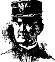
THESE SOLDIERS WHO RETURN TO THE UNITED STATES...