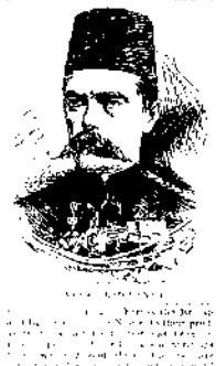
...soldier in uniform...