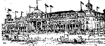
Wayne National Bank Building in Omaha, Nebraska.