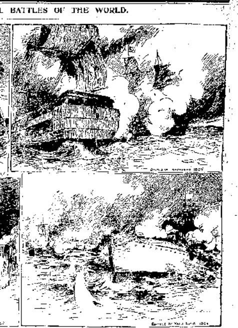
FAMOUS NAVAL BATTLES OF THE WORLD.