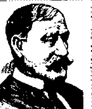
GENERAL ANTONIO MACED.