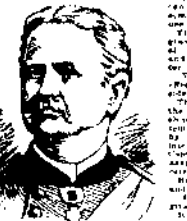
GENERAL WENLEY MERRITT.