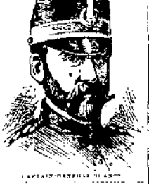
A member of the United States Army, possibly involved in the invasion plan.

The fleet in New York is expected to be in the vicinity of Matanzas, Cuba, for a period of several months. The fleet, consisting of the battleships USS Oregon and USS Nevada, along with several destroyers and submarines, is believed to be operating in the waters off the Cuban coast.