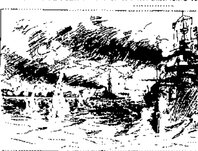
A battleship at sea, likely one of the American warships operating in the Caribbean.

The USS Oregon, USS Nevada, and other American warships are believed to be operating in the waters off the Cuban coast. The fleet is expected to be in the vicinity of Matanzas, Cuba, for a period of several months.