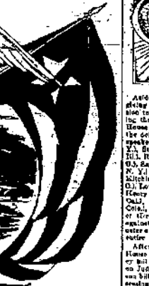
New York Journal.

The nation is in a state of mourning for the brave men who died in the disaster of the Maine. Their families are being supported by the government and the people.