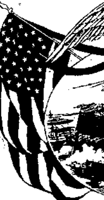
New York Journal.

The nation is in a state of mourning for the brave men who died in the disaster of the Maine. Their families are being supported by the government and the people.