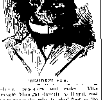
... (Caption for the person's face illustration)