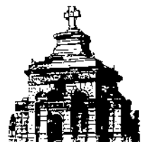
... (Caption for the building illustration)

... (Continuation of the inventions article)