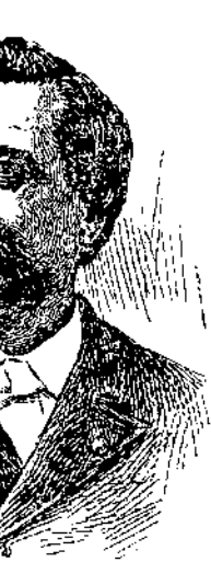
JOHN EDGAR LOGAN

The Logan monument at Chicago is a masterpiece of art and a fitting tribute to the great soldier and statesman. The statue, which stands on a high pedestal in the center of the city, is a masterpiece of art and a fitting tribute to the great soldier and statesman. The unveiling ceremony was attended by thousands of people, and the parade of veterans that followed was one of the most impressive in the city's history.