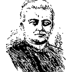
JOHN A. LOGAN

John A. Logan was a prominent statesman and soldier. He served in the Union Army during the Civil War and was later a member of the United States Senate.