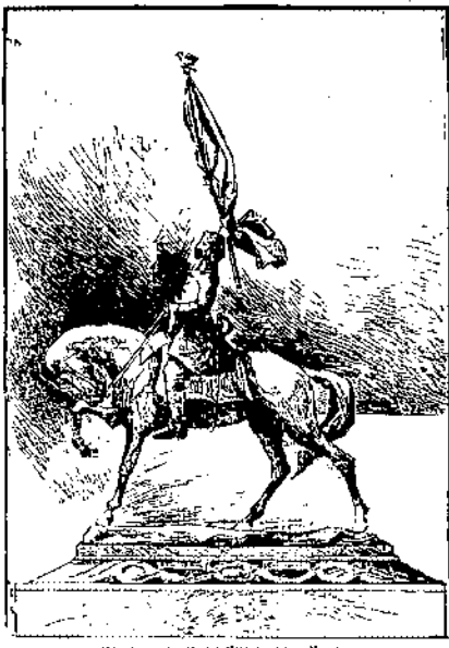
THE LOGAN STATUE AT CHICAGO.