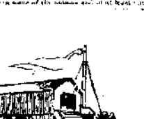
REAR ADMIRAL BEARDSLEE

The Senate today was engaged in the consideration of the bill to amend the act relating to the appointment of judges. The bill was passed by a vote of 75 to 15. The Senate also considered the bill to amend the act relating to the appointment of judges, which was passed by a vote of 75 to 15.