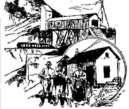
A REAL THREAT AND A MENACE HOME IN THE PANHANDLE DISTRICT.

The coal companies are using this method of mining to gain an unfair advantage over the coal miners. They are trying to drive the coal miners out of business and to control the coal industry.