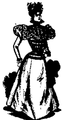
BUTTERICK PATTERN 601A.