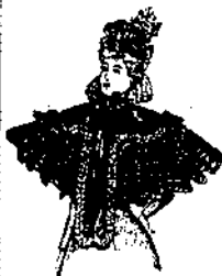
BUTTERICK PATTERN 601A.