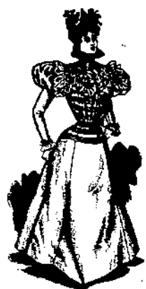
BUTTERICK PATTERNS 0036

This is only one of the many beautiful Capes in our Summer stock, the price, just think of it, a nice Cape for $1.75 We have now open for inspection a full line of the latest novelties in LADIES' SHIRT WAISTS, WRAPPERS, COLLARS, CUFFS, BELTS, ETC., ETC.