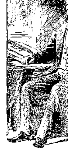
Portrait of a man, likely a high-ranking official.