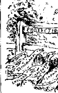
The passing of the long government bill (the American law).