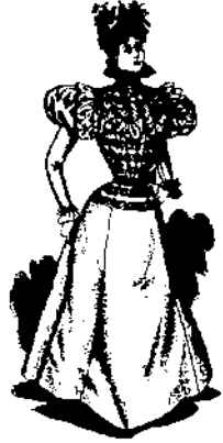
BUTTERICK PATTERN 601A.

WARRIOR - The young boys of the city are holding a contest of strength and endurance. The contest will be held on the city square on Saturday afternoon. The boys will be divided into two teams and will compete in various events such as running, jumping, and wrestling. WARRIOR - The young boys of the city are holding a contest of strength and endurance. The contest will be held on the city square on Saturday afternoon. The boys will be divided into two teams and will compete in various events such as running, jumping, and wrestling.