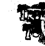
THE STORY OF THE MUD.