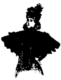
BUTTERICK PATTERN 601A.