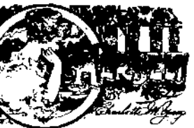
THE STORY OF THE MUD.

And now... the value of the... the value of the... the value of the...