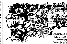
INFLUENCE OF REALTY.