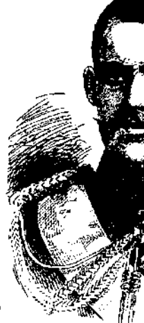
PRINCE CONSTANTINE, COMMANDER OF THE GREEK FORCES.

The Turkish battery at Nigeria (Continued) was reported to have been destroyed by the Greek forces. The battery was reported to have been destroyed by the Greek forces. The battery was reported to have been destroyed by the Greek forces.