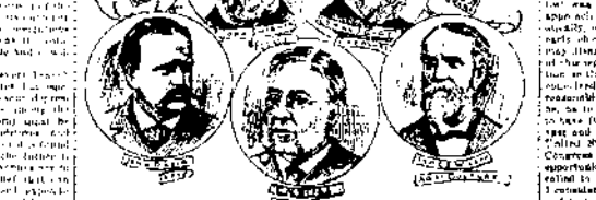
PRESIDENT McKinLEY'S CABINET

The failure of the McKinley Bill has caused a great deal of concern in Chicago and Illinois. The bill was a landmark piece of legislation and its failure has left many people wondering what the future holds. The bill was intended to provide for the reorganization of the government and to address the needs of the people. The failure of the bill has caused a great deal of concern in Chicago and Illinois. The bill was a landmark piece of legislation and its failure has left many people wondering what the future holds. The bill was intended to provide for the reorganization of the government and to address the needs of the people.