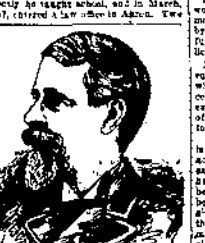
Wagon in the Cabinet.