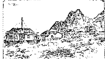
THE ST. ANNE'S SCHOOL ISLAND.

He was a man of letters, a man of letters, a man of letters. He was a man of letters, a man of letters, a man of letters. He was a man of letters, a man of letters, a man of letters.