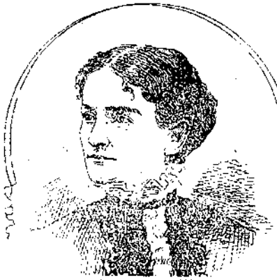
MRS. WILLIAM MCKINLEY.