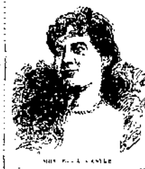
THE CASTLE CASE.

The man in the Castle case was a man of high social standing. He was a member of the aristocracy and was well known in the community. The case was a scandal and caused a great deal of discussion. The man was found guilty and sentenced to a term of imprisonment.