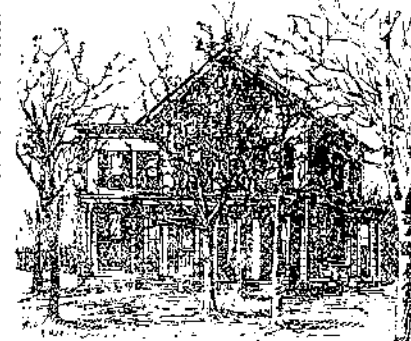
HOME OF THE MCKINLEYS AT CANTON, OHIO.

The McKinleys are a family of the highest social standing in the United States. Their home is in Canton, Ohio, where they have lived for many years. The McKinleys are a family of the highest social standing in the United States. Their home is in Canton, Ohio, where they have lived for many years. The McKinleys are a family of the highest social standing in the United States. Their home is in Canton, Ohio, where they have lived for many years.