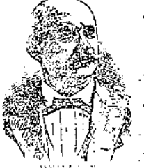
Portrait of Chas. F. Crisp.