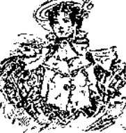
ALFRED HENRI'S NEW BOOK.

A new kind of woman's voice is heard in the world. It is a voice that is clear and strong. It is a voice that is heard in the world. It is a voice that is heard in the world. It is a voice that is heard in the world.