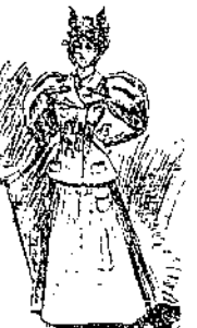
ALFRED HENRI'S NEW BOOK.

GIRLS' POCKETS. P ockets are not a luxury for the girl, but a necessity in the same way as the pocket is a necessity for the man. It is a fact that the girl's pocket is often the only place where she can keep her money, her keys, and her other necessities. It is a fact that the girl's pocket is often the only place where she can keep her money, her keys, and her other necessities. It is a fact that the girl's pocket is often the only place where she can keep her money, her keys, and her other necessities.