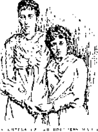
THE MOTHER OF A NATION...