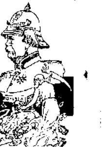
Portrait of Otto von Bismarck.