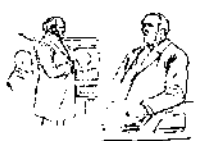
...of the opinion of their... of the Senate...