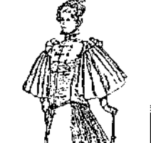
Illustration of a woman in a long dress, possibly a designer or a model.