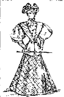
Illustration of a woman in a long dress, possibly a designer or a model.