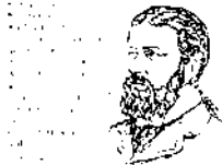
Portrait of the author of the article.

THE CLAIMS OF ENGLAND AND VENEZUELA. The claims of England and Venezuela are discussed in detail. The article covers the historical and geographical aspects of the dispute. It mentions the Gulf of Paria, the Gulf of Venezuela, and the Gulf of Guayana. The article is written in a formal and detailed style.